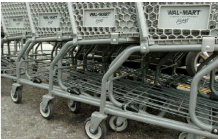
Shopping carts line up at the Coldwater Road Wal-Mart Supercenter.

The Wal-Mart Supercenter at 5311 Coldwater Road is one of three Supercenter stores in Allen County.